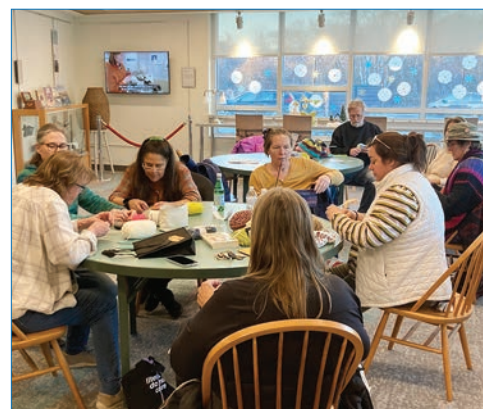
The Library's popular new knitting/crochet club