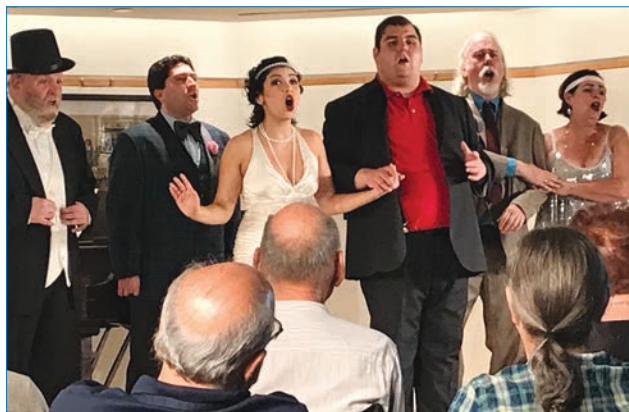
Last summer's performance of "The Mikado: A Long Island Fantasy" by The Gilbert & Sullivan Light Opera Company of Long Island