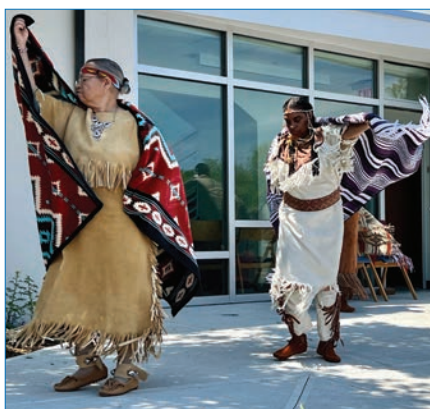
Montaukett Women's Circle Dancers