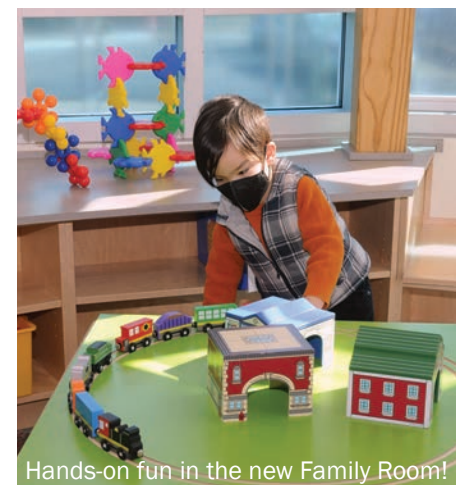
Hands-on fun in the new Family Room!

Para obtener una versión en Español de esta información, por favor llama a la biblioteca al 631-668-3377.