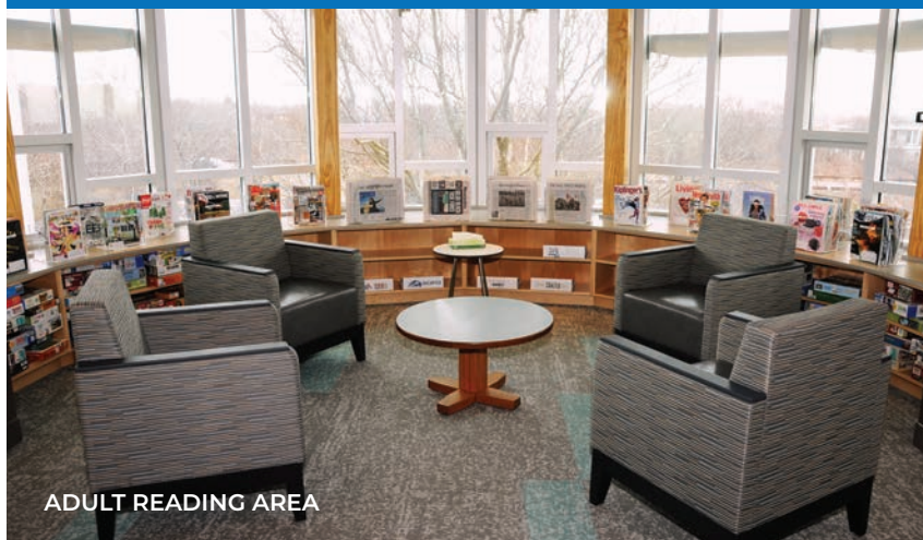
ADULT READING AREA