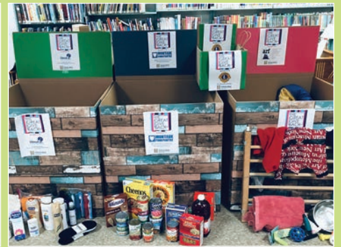
Donation items for The Great Giveback