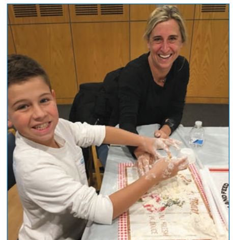
Making pasta dough during the Library's National Spaghetti Day children's program, early 2020

Para obtener una versión en Español de esta información, por favor llama a la biblioteca al 631-668-3377.