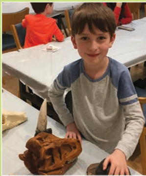
Discovering Dinosaurs program