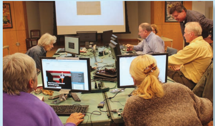
A Senior Technology Class at the Montauk Library