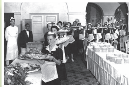
Manor Staff, circa 1940s