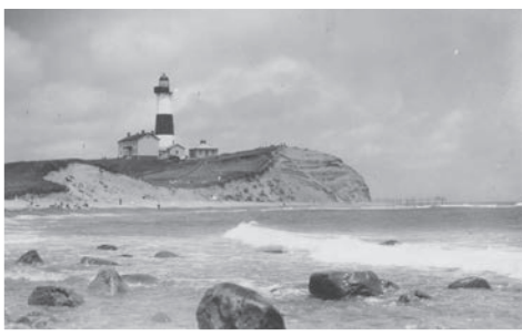
Lighthouse, circa 1930s, Lynn Duryea collection