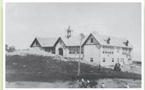
Building the Montauk School, circa 1927